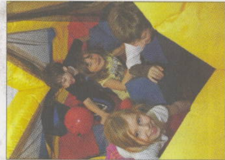
A hair-raising good time