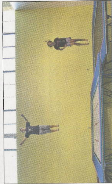
Having a bounce on the trampolines