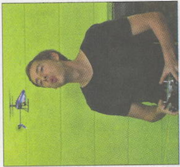
The helicopter guy is a high-flying hit at kids' birthday parties